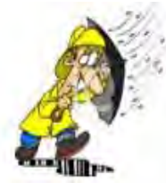
“The Weather Man”

October 2009 came nowhere near matching the wettest month in recent memory in Froyle, namely the infamous October 1987; indeed, despite the first 10 days having the most rainfall since 2001 - courtesy ex-Tropical Storm Grace - yet again it was, for the 7th month out of the last 8, well below the long-term average. To put this in perspective, even if we were now to have the wettest november and December for the last 20 years, this would still only put us marginally above the average.